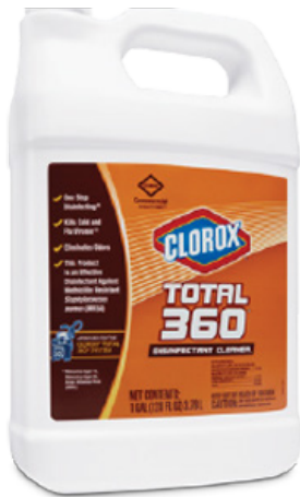
4/1 Gallon Item# CLO31650